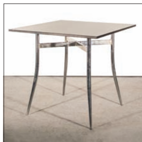
Total Mob table EUR 21.00 Code 025.010.020.083 (80x80x73 cm)