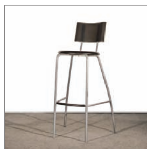
ANSSI bar stool EUR 12.00 (with back) Code 025.010.040.084