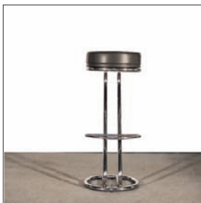
Black bar stool EUR 11.00 Code 025.010.040.080