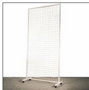
Grid stender EUR 21.00 Code 025.010.120.169 (100 x 200 cm)