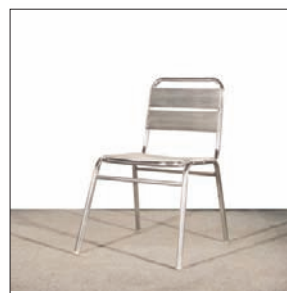
Aluminium chair EUR 15.00 Code 025.010.040.015