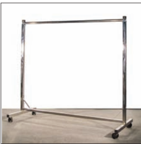
Exhibiting stender EUR 26.00 Code 025.010.120.160