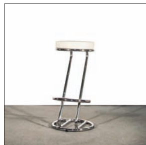
White bar stool EUR 11.00 Code 025.010.040.079