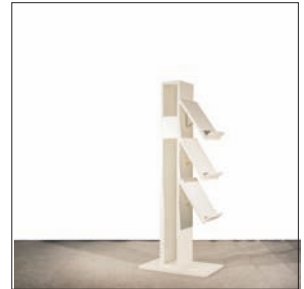
PAL leaflets support EUR 44.00 Code 025.010.150.040