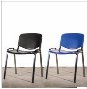
Leda chair EUR 11.00 (nickeled) Code 025.010.040.040 - black Code 025.010.040.120 - blue