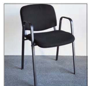
Rio CN Maxi chair EUR 11.00 Code 025.010.040.032