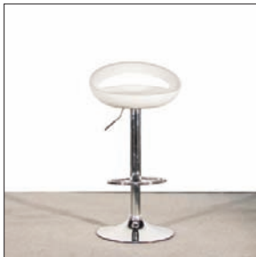
Miami ABS bar stool-white EUR 12.00 Code 025.010.040.160 (47 x 40 x 60-80 cm)