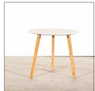
Winter coffee table EUR 12.00 Code 025.010.020.192 (50 cm diameter; H: 45 cm)