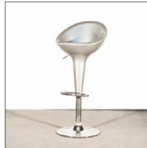
ABS bar stool EUR 12.00 Code 025.010.040.082 – grey Code 025.010.040.083 – red Code 025.010.040.085 – orange