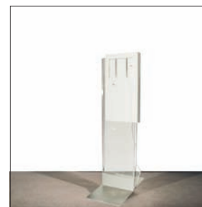
Display info - tablet support EUR 170.00 Code 025.010.150.045 (153 x 40,3 cm)