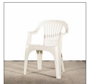
Plastic chair EUR 6.00 (white) Code 025.010.040.060