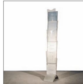
Display support vertical EUR 44.00 Code 025.010.150.041