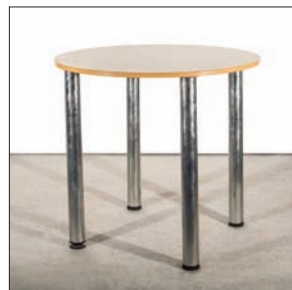
Oak round table EUR 21.00 Code 025.010.020.091 (80 cm diameter; H: 73 cm)