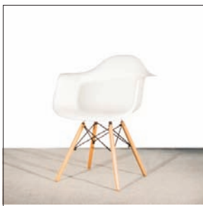
Eames chair-white EUR 18.00 Code 025.010.040.150 (61 x 62 x 77.5 cm)