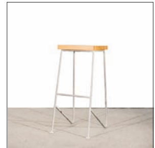
Domicilio stool EUR 26.00 wooden seat Code 025.010.040.140 (36 x 34.5 x 75 cm)