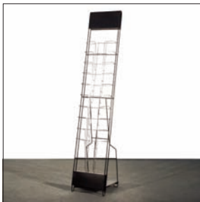
Metal stand for presentation EUR 65.00 Code 025.010.120.167