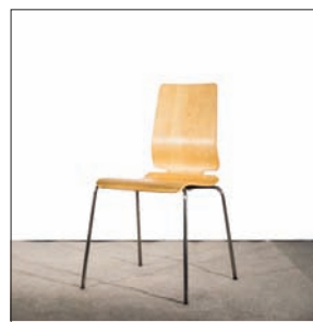
Gilbert chair EUR 11.00 Code 025.010.040.043 – oak Code 025.010.040.044 – white Code 025.010.040.045 – black