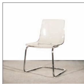
Clear plastic chair EUR 11.00 Code 025.010.040.035