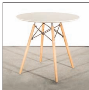
Marta table EUR 24.00 Code 025.010.020.190 (80 cm diameter; H: 73 cm)