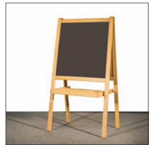
Wooden easel EUR 14.00 Code 025.010.120.168