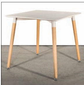
Eames square table EUR 36.00 Code 025.010.020.160 (80 x 80 x 74 cm)