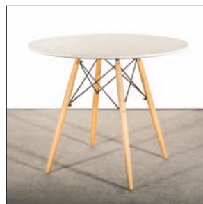
Eames round table EUR 36.00 Code 025.010.020.170 (90 cm diameter; H: 75 cm)