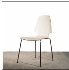
White veneer chair EUR 11.00 (steel frame) Code 025.010.040.050