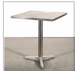
Aluminium table EUR 21.00 (square) Code 025.010.020.000 (60x60x68 cm)