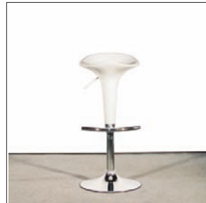
Vida ABS bar stool-white EUR 12.00 Code 025.010.040.170 (38 x 36 x 66-87 cm)