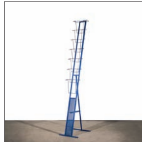
Brochures expo stender EUR 44.00 Code 025.010.150.042