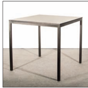
Germania table EUR 21.00 Code 025.010.020.080 (80x80x72 cm)