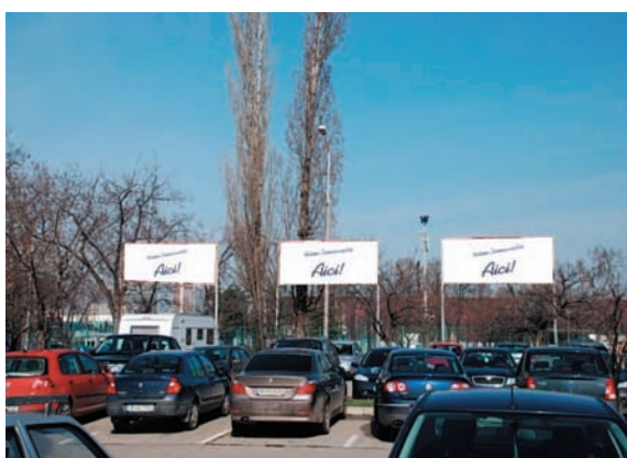
BANNER DISPLAY AT PARKING-GATE B