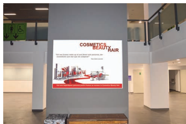
SNAP FRAME, SIZE 200X140 CM