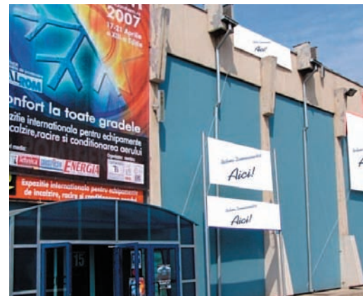
BANNER DISPLAY ON PAVILION C1 FACADE