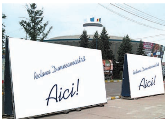
BANNER DISPLAY ON MOBILE PLATFORMS