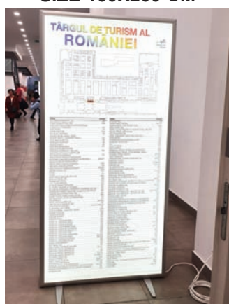
POSTER DISPLAY ON LED ILLUMINATED TOTEM, SIZE 100X200 CM