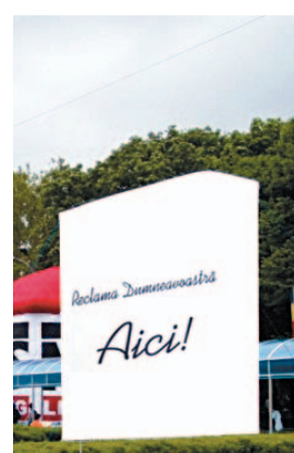
ADVERTISING MASCOTS DISPLAY