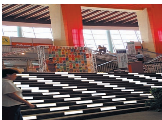
STICKERS DISPLAY ON PAVILION'S STAIRS AND FLOOR