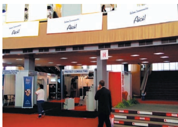
BANNER DISPLAY ON PAVILION A, FRIEZE 4.50